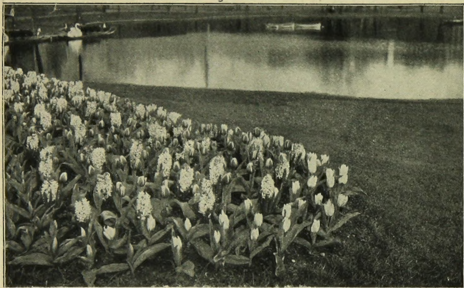
A Bed of Hyacinths and Tulips